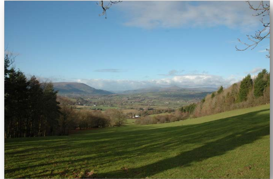
Looking over the Usk Valley towards the Black Mountains