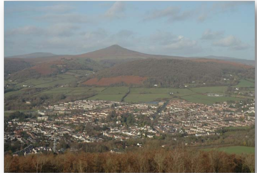
Another of Abergavenny's seven hills - Sugar Loaf from the Little Skirrid

Steep rocky path on west side of Little Skirrid. Recommended to walk this route clockwise so you go up this steep path.