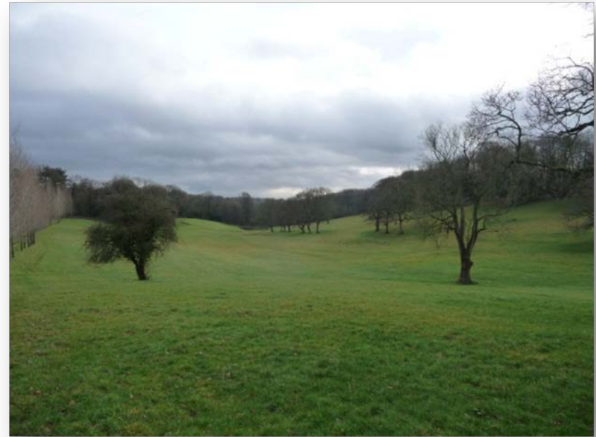
Looking down the Golden Valley